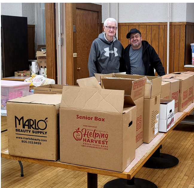
Easter Food Boxes