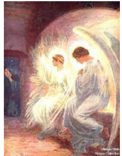
Luke 24, 1-4