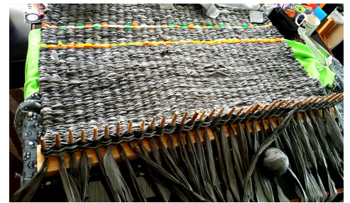
Woven Mats for Homeless

CUMC has received 2 looms for making mats for the homeless from the residents at Douglass Village. The mats are made by recycling plastic store bags. We first take the bags and turn them into PLARN (plastic yarn) before we weave the mats. So - the most important item we need are plastic bags. All colors of plastic bags. If you go to Shady Maple – we love their blue bags. Shop Rite has bright vellow, and the brown bags from Home Depot look like wicker. Of course anything from Giant, Weis, Wegmans, Walmart help fill in the designs. Please leave your bags in Fellowship Hall. As an extra help, if you can fold them it would be a GREAT time saver. Thanks for helping to kick-start this project.