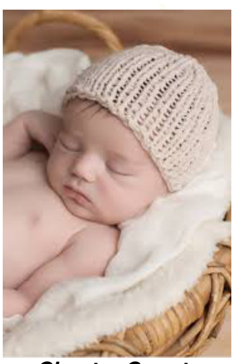
From Chester County Hospital – recipients of baby hats from our Cedarville knitters: