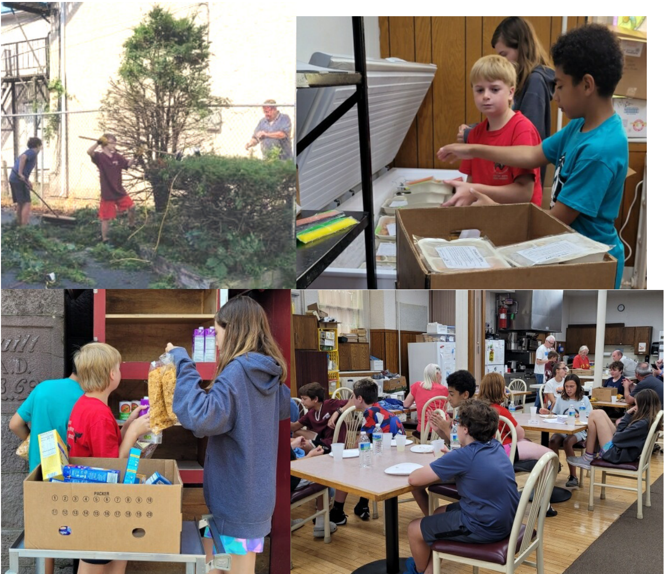
Young adults from New Hanover UMC – donating week of service at Mission First