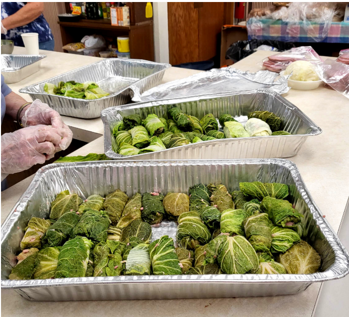
Volunteers making Stuffed Cabbage

Our continuing ministries are still in need of your support. In this hot weather we go through a few cases of water a day, so donations are always welcome. We also need bath towels, deodorant, shampoo, conditioner, body wash, shaving cream, razors and men's underwear size large. If you'd like to donate or help, stop by or call Clare at 610-326-0560.