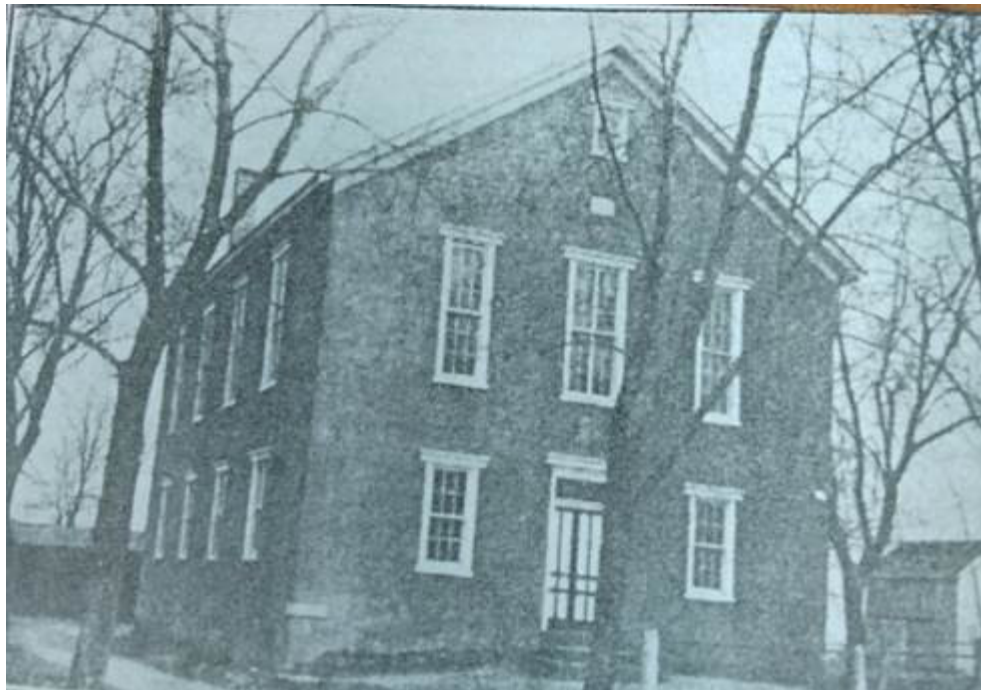
St. James Methodist Episcopal Church – Foundation Laid in September, 1873 (Later renamed Cedarville United Methodist Church)

Plan to join our celebration of 150 years of ministry of Cedarville with your church family.