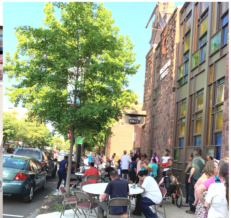
Memorial Day Picnic