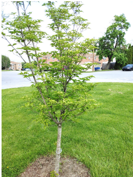
(Dogwood Tree Planted May, 2020 in celebration of the merger)

Better Together! Third Anniversary of Merger Between First U.M.C. of Pottstown and Cedarville U.M.C